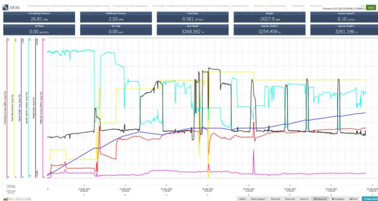
Figure 1: Live IDEX Data Chart Trend